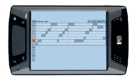
Fig. 3. The Semantic HIFI PDA Remote Control

Interface proposed. The visualization tool displays the track structure as an audio/midi sequencer representation (see Fig. 4). Time is represented in the horizontal axis.