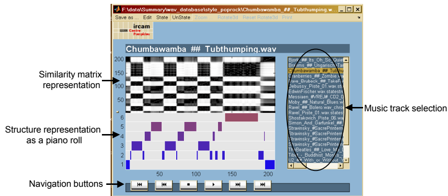
Fig. 1. Prototype of advanced media player (as proposed in [5]) displaying the track similarity matrix (top part of the display) and the structure representation as a piano-roll (lower part of the display) for track Chumbawamba “Tubthumping” [EMI].

This description provides a semantic of the structure of a music track however it does not provide a semantic of each segment. Indeed, it is still difficult to assign a semantic to each part (i.e. telling which number among the above 1,2,3 is the chorus and which one is the verse) without making strong assumptions on the music genre (such assumptions are in fact not justified for many tracks). The extracted structure is then read by an advanced media player [5], which allows the user to interact with the song structure during its listening (see Fig. 1)