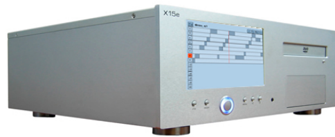
Fig. 2. The Semantic HIFI