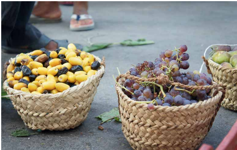
Photo 4: Grapes, figs, and early dates sold directly in the informal market in the evening upon return from the gardens (Photo by V. Battesti, August 2011)