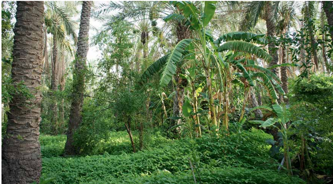
Photo 1: Cultivars of dates, bananas, pomegranates, figs, citrus, apricots, and tossa jute ( Corchorus olitorius L.) in the old palm grove of Tozeur