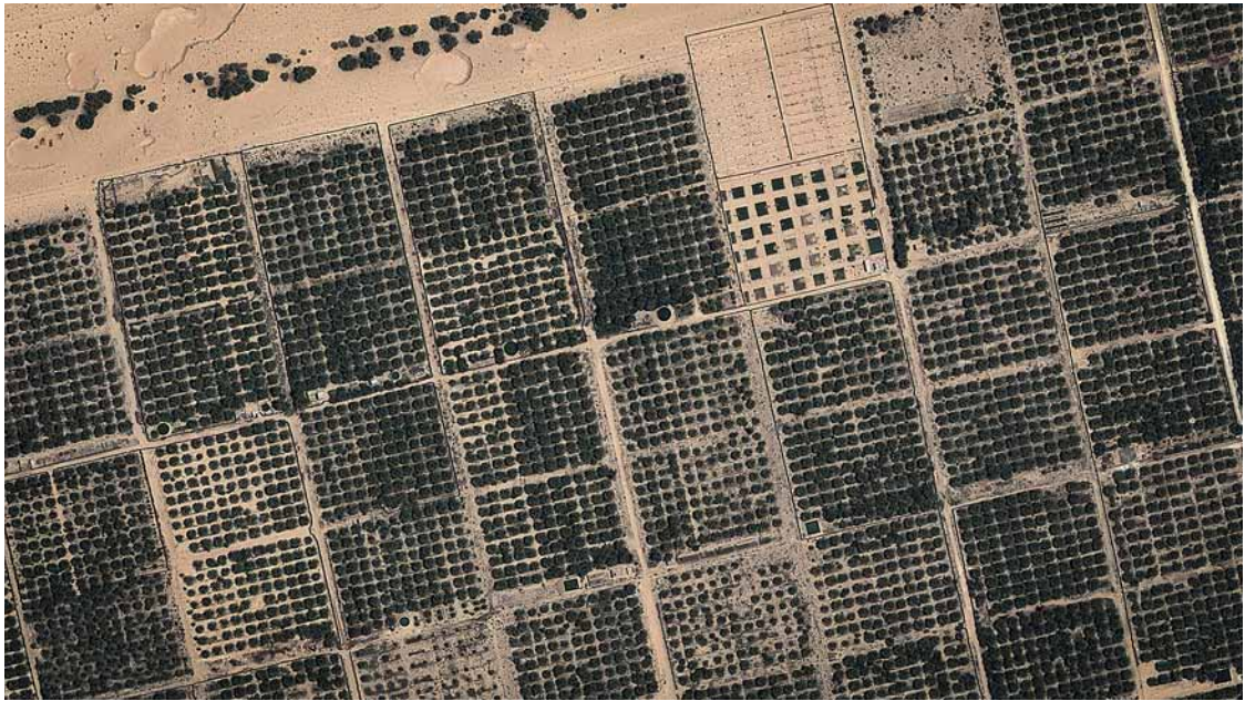
Photo 2: Satellite view of the modern palm grove of Ibn Chabbat and its Deglet Noor date palms