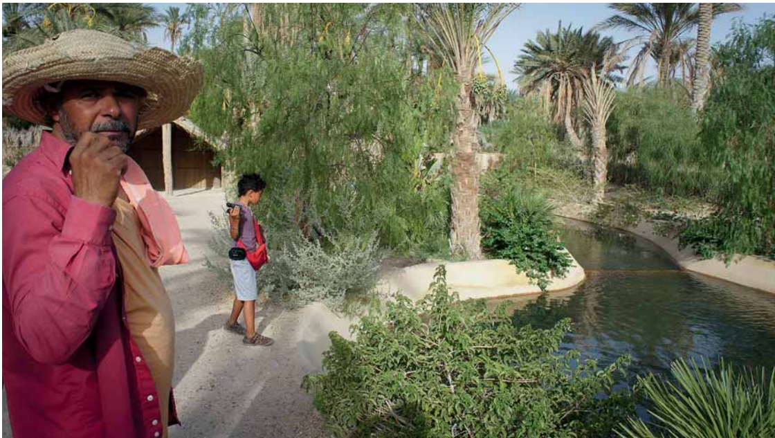
Photo 3: On a water path for tourism – Corbeille de Nefta