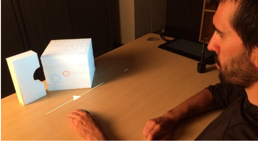
Fig. 1. A user moving a cursor (represented in blue) to a target (represented in red) on an augmented object by way of a standard mouse.

suiting to point at visual objects displayed on 2D screens. Our assumption is that they can benefit to SAR as well, as soon as precision and prolonged work is required.