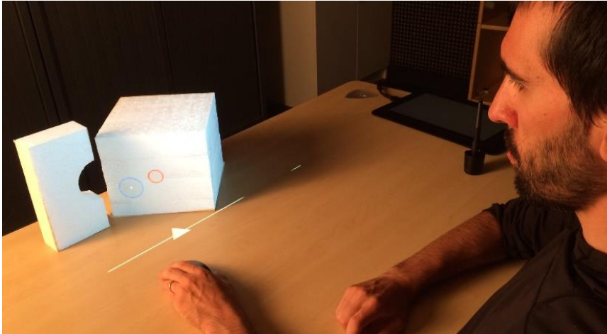
Fig. 1. A user moving a cursor (represented in blue) to a target (represented in red) on an augmented object by way of a standard mouse.

suiting to point at visual objects displayed on 2D screens. Our assumption is that they can benefit to SAR as well, as soon as precision and prolonged work is required.