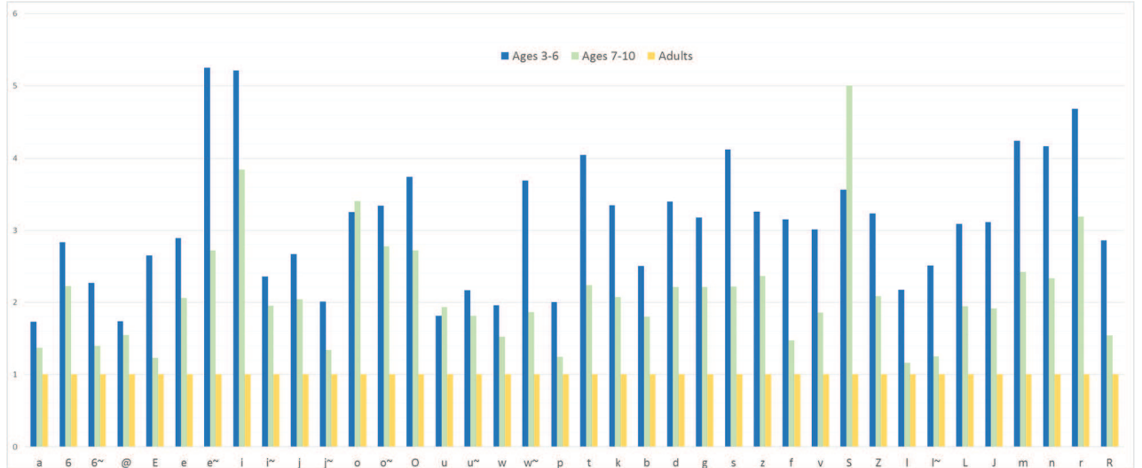
Fig. 1. Average GOP scores for 3-6-year-old and 7-10-year-old speakers, relative to the GOP scores of adult speakers.

Table 2 summarises the speech recognition results obtained with the baseline recogniser and the children’s speech recogniser. The children’s speech recogniser significantly outperformed the baseline recogniser. It improved by 45% relative over the performance of the baseline recogniser. The improvement was also 45% when calculated separately for both 3-6-year-olds and 7-10-year-olds. Similar to other studies [3-5, 7], the WERs were considerably higher in the case of the younger children.