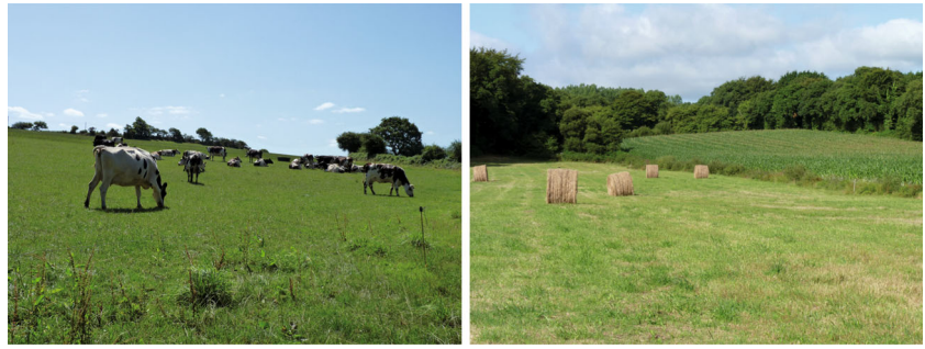
Fig. 1 In western France, grazing ( left ) and mowing ( right ) practices can be observed in grasslands during the growing period

conducted on 4 of the 70 farms located in the study site to obtain information on grassland management practices. This information was used to validate PaturMata.