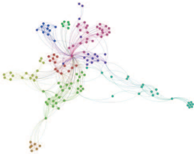
Fig. 6. Network of concepts generated for December 16, 2013 containing the hashtag: #noalospuris.