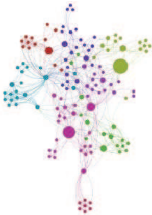
Fig. 2. Network of concepts generated for December 10, 2013 containing the hashtag: #noalospluris.