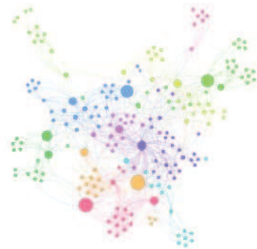
Fig. 4. Network of concepts generated for December 12, 2013 containing the hashtag: #noalospluris.