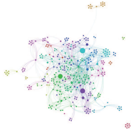
Fig. 3. Network of concepts generated for December 11, 2013 containing the hashtag: #noalospluris.