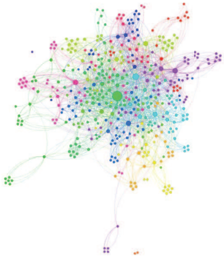
Fig. 1. Network of concepts generated for December 6, 2013 containing the hashtag: #noalospluris

Visual representation of the network is important to understand the evolution of concepts used over the time as they tend to concentrate in communities that share the same thematic.