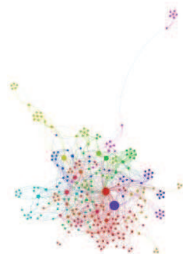
Fig. 5. Network of concepts generated for December 13, 2013 containing the hashtag: #noalospluris.