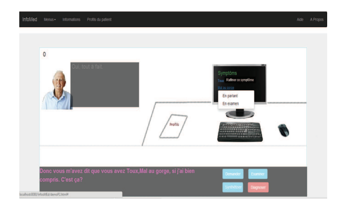
Fig. 1. Example of AgileDoctor prototype interface

composed of three elements: phases, dialogue sessions and phrases. The model organizes these elements and defines the contents of each element.