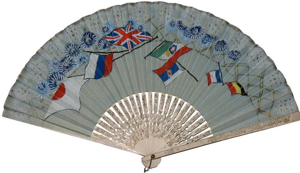
Fig. 1: Oriental fan with added flags of Japan, Russia, the U.K., Italy, Serbia, France, and Belgium 1 .