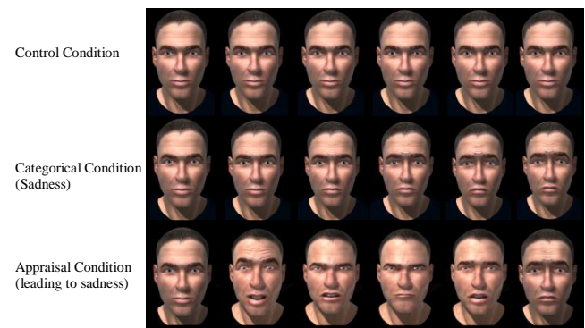
Figure 3. Frames of the VC’s expressions: control condition, categorical condition (sadness), appraisal condition (sequence leading to sadness with the following values of appraisal checks: unexpected, unpleasant, high goal hindrance, no coping potential).

The animation module generates temporary facial expressions of checks and creates the resulting dynamic sequence of facial expressions. Temporary facial expressions of check were specified using FACS descriptions of appraisal effects [31].