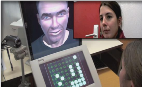
Figure 1. Participants played Reversi against a VC. A touch screen was used to interact with the Reversi board.

Two-player turn-based games such as chess are relevant for affective computing research [43]. We selected and implemented a game called Reversi (Figure 1). This competitive game is played by two players on an 8x8 grid board. This game is easy enough to learn, features a small set of possible events and hence sounds appropriate for conducting experimental studies about appraisals.