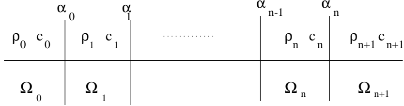
FIGURE 1. Cracks \alpha_k separating elastic media \Omega_k and \Omega_{k+1} . The physical parameters are the density \rho_k and the sound speed c_k .

The paper is organized as follows. The physical motivation of the study is given in Section 2. The case of N = 2 cracks is investigated in Section 3. After recalling known properties, a new result of asymptotic stability is given. An extension for N = 3 cracks is proved in Section 4.