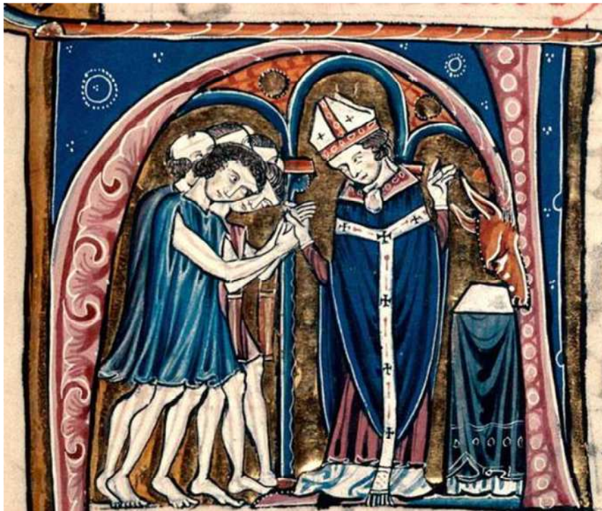
ms. 138, f. 120r: historiated initial at the beginning of the prayer "Adesto supplicationibus nostris..." of Holy Thursday, depicting the return of the penitents to church.

The cleric responsible for copying the Ordo representacionis Ade did not consider it necessary to note the responsories in their entirety. For him—or for the performers of the Ordo —it sufficed to open a breviary or an antiphony to refresh their memory. Through a consultation of such books, it is possible to uncover the different liturgical chants used in different religious institutions and, in so doing, to compare their contents with the responsories of the Ordo . The liturgical environment of the Ordo may have been the same as that of the manuscripts containing the seven responsories and these liturgical books may thus indicate the religious institutions where the Ordo representacionis Ade was performed and/or where it may have been copied.