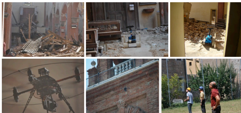
Fig. 2 Duomo in Mirandola, Northern Italy. Top: Main aisle (l.), UGV exploring eastern aisle (m.), top of the western aisle (r.). Bottom: UAV exploring eastern aisle (l.), exploring cracks in bell tower (m.), UAV team (r.).

command post, two unmanned ground vehicles (UGVs), and two quadcopter unmanned aerial vehicles (UAVs). The crucial insight from this deployment was the need for persistent, integrated situation awareness that builds up over multiple sorties during a mission, and that different kinds of robots each play complementary roles in this process [23].