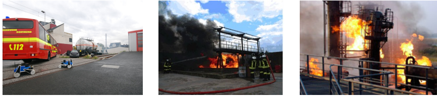
Fig. 3 Examples of training sites in Germany, Italy, and the Netherlands.