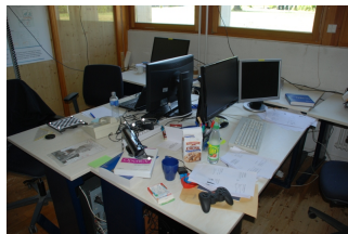
(a) Typical office scene