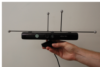
(c) Microsoft Kinect sensor with reflective markers