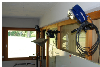
(b) Motion capture system