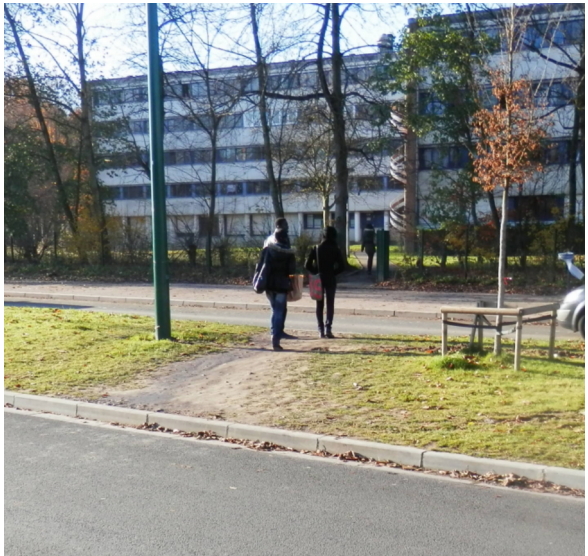
Figure 2. The desire line revealing tensions in the formation of distances as a compromise between least-effort and risk associated with road safety (picture L'Hostis 2013)

Sociologists have introduced the term of desire line to describe the visible path generated by walkers in landscapes (Simmel 1997, 171). These desire lines reveal the tensions in the formation of distances, most often resulting from a compromise between least-effort and risks associated with road safety. It seems then legitimate to focus on the weight of the least-effort argument in pedestrian routes in general; to what degree is the least-effort trajectory favoured in general situations? Indeed, the desire lines are revealed under particular conditions, namely the existence of a surface which, as in the example of soil covered with grass, is able to record and make visible the flow of pedestrians.