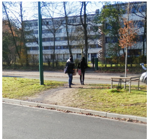
Figure 2. The desire line revealing tensions in the formation of distances as a compromise between least-effort and risk associated with road safety (picture L'Hostis 2013)

Sociologists have introduced the term of desire line to describe the visible path generated by walkers in landscapes (Simmel 1997, 171). These desire lines reveal the tensions in the formation of distances, most often resulting from a compromise between least-effort and risks associated with road safety. It seems then legitimate to focus on the weight of the least-effort argument in pedestrian routes in general; to what degree is the least-effort trajectory favoured in general situations? Indeed, the desire lines are revealed under particular conditions, namely the existence of a surface which, as in the example of soil covered with grass, is able to record and make visible the flow of pedestrians.