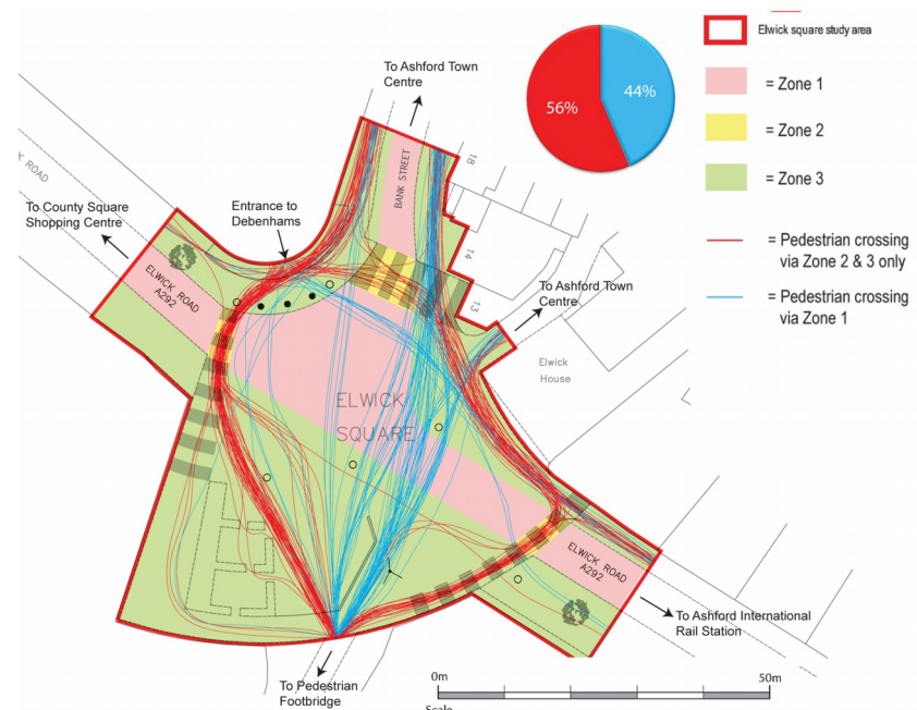
Figure 3. Optimisation in pedestrians routes in a shared space in Ashford (UK) (Moody et Melia 2013)

Nevertheless, we can object that not every trajectory in geographical space seeks to minimize the effort. The list of