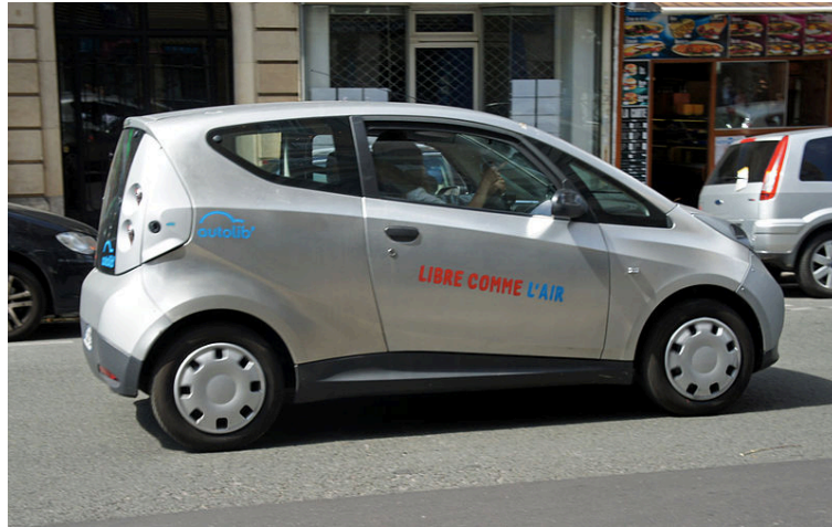
Figure 1 A Bluecar in Paris