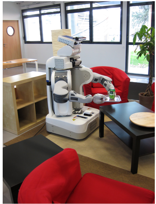
Figure 1: The PR2 Robot.

In the current setup, we rely on some of PR2 basic capabilities 4 : navigating in a household like environment; recognizing objects; picking them up and putting them down. Actions are dispatched just in time to PRS which executes them when their start time has arrived. PRS monitors the proper