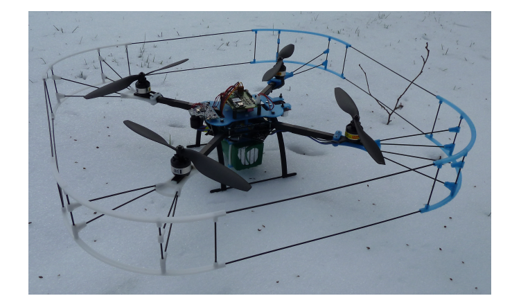
Fig. 2. Experimental quadrotor

system does not deliver translational velocity measurements. The only speed measurements available are the angular ones, through the IMU.