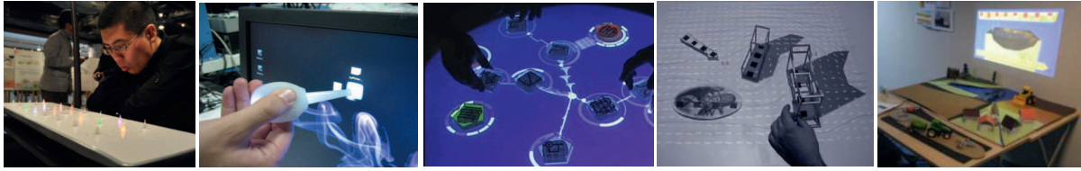
Figure 2. Five metaphoric tangible interfaces: Tangible Light [19], Slurp [21], Reactable [13], URP [20], MISE [17].

sides [14], and also in interfaces an extensive coverage is hardly obtained; while the knowledge domains on which the metaphors are based may be very large, the interface implementation covers a limited set of objects and actions relevant for the digital application.