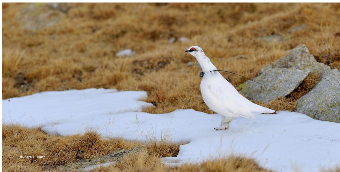
A young rock ptarmigan male in early November, two months after his translocation. His winter plumage is almost complete but snow cover is only patchy.

translocation did not result in an over-dispersion of birds, which may sometimes be a cause of translocation failure (Dickens et al. 2009).