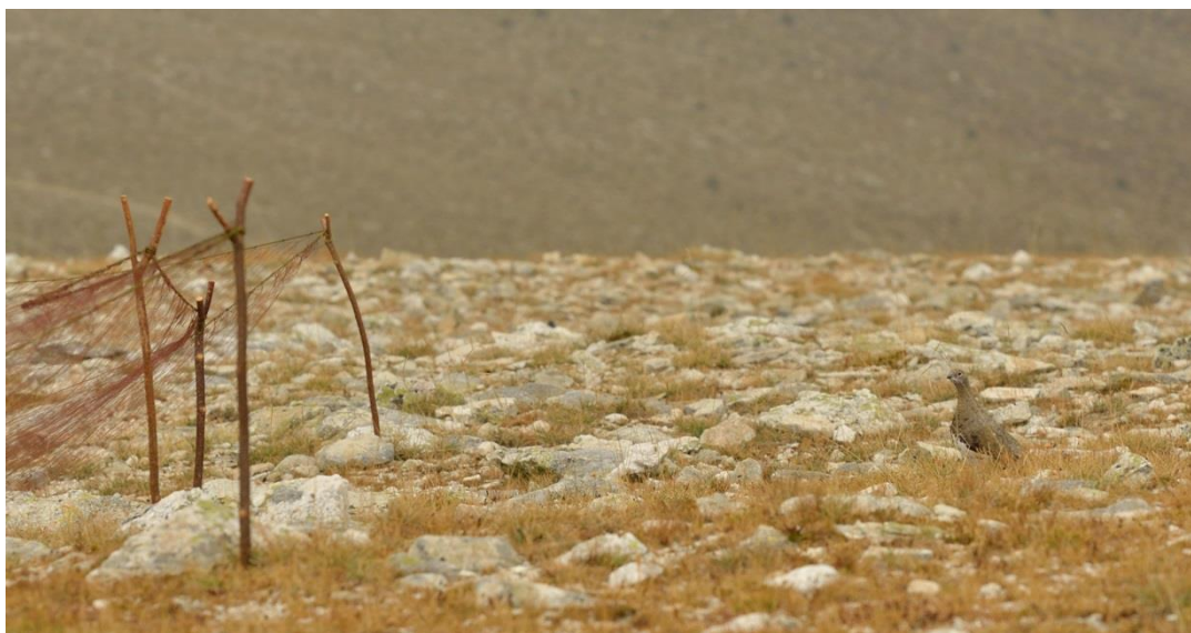
A rock ptarmigan has been driven towards a net barrage. The bird is hesitating in front of this unusual obstacle. Last and crucial instants before its capture.

Both transferred and control birds were located at least once every 15 days from the ground using a portable receiver and a handheld Yagi antenna. Aerial surveys by fixed-wing aircraft equipped with an antenna were undertaken if any transmitter signals were lost.