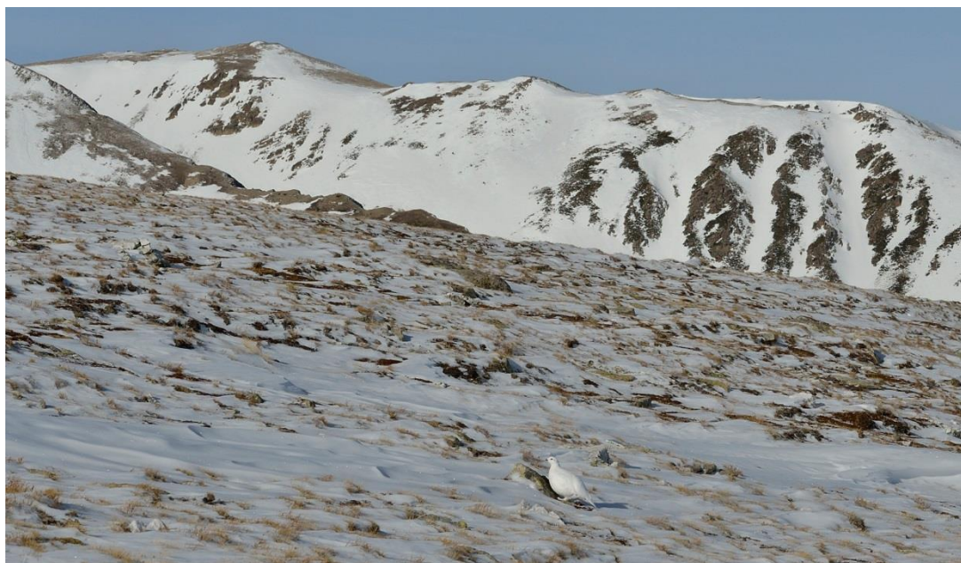
A view of the rock ptarmigan habitat in the eastern part of the Pyrenees (Canigou massif).

Birds transferred survived well, mated with native birds and these "mixed" pairs produced a minimum of 23 full-grown chicks. The good survivorship and low dispersal rate of transferred birds was perhaps associated with the timing of the translocation on the one hand and with the choice of release sites on the other hand.