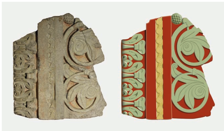
Figure 1. Fragment of the first jamb (limestone, 40x35 cm) and coloured restitution. Reproduced with permission of S. Castandet and A. Mazuir, Arts et Métiers ParisTech, Cluny, France.

Two samples, taken from the background of the lintel, presenting only the layer of lead white mixed with carbon black, were visually blue. Is it a deliberate optical effect, or is it due to the sampling?