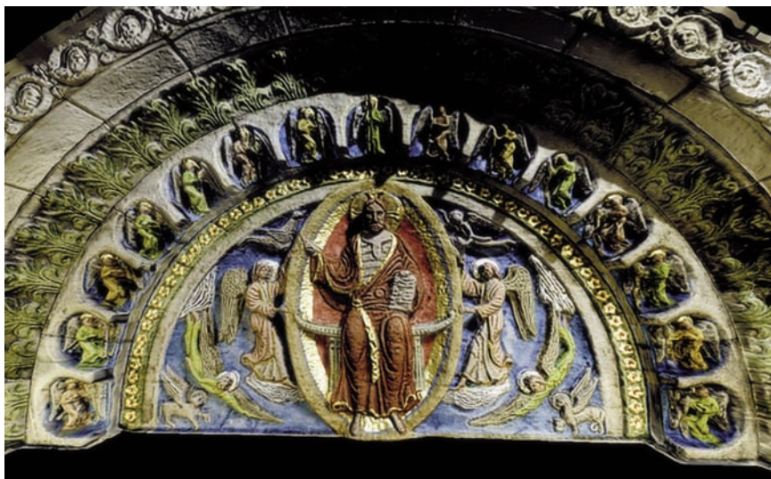
Figure 4. First try of coloured restitution.