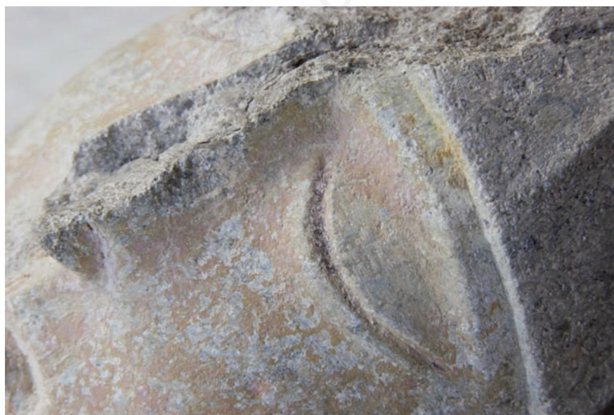
Figure 3. Head of the sleeping soldier (limestone, 16x9 cm) coming from the lintel.