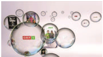
Figure 3. Using the visual metaphor to represent the different elements and content of the user interface

To achieve this vision, we used the visual metaphor of soap bubbles and included it as a primary component of the user interface, applying its physical properties and embodied meanings to the representation of the information. The fact that soap bubbles are multiple, numerous objects, while being physically the same allowed us to use it as a primary component of an interface, ensuring consistency through the different parts of the interface. Each piece of information is encompassed into one soap bubble, giving it a familiar texture that would help the user to interact with.