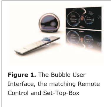
Figure 1. The Bubble User Interface, the matching Remote Control and Set-Top-Box