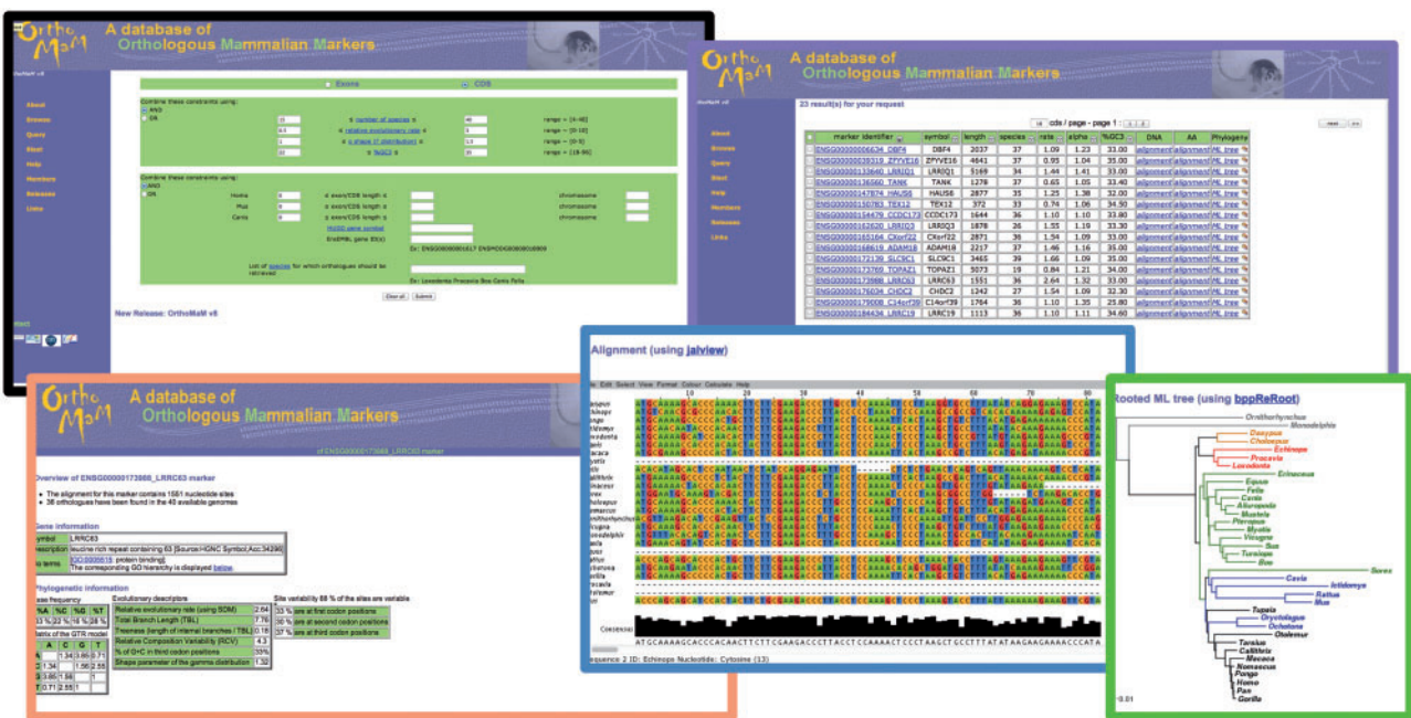
FIG. 1. Screenshots from the OrthoMaM website. Here, we searched for CDS with 15–40 mammals, a relative evolutionary rate between 0.5 and 3, an \alpha parameter of the \Gamma distribution ranging from 1 to 1.5, and a GC3 between 22% and 35%. We got 23 target CDS and focused on the LRR63 marker. We then visualized the evolutionary dynamics parameters, the first 80 sites of the DNA alignment, and the corresponding phylogenetic tree.

The one-to-one orthologous exon clusters are not provided by Ensembl. Their identification is complicated by alternative splicing and by the variability in number and length of exons of a given gene across species. We tackle those problems by relying on the alignments of the one-to-one orthologous CDS to infer one-to-one orthology among their exons. Each human exon annotated by Ensembl initiates a one-to-one orthologous exon cluster. Exons from additional