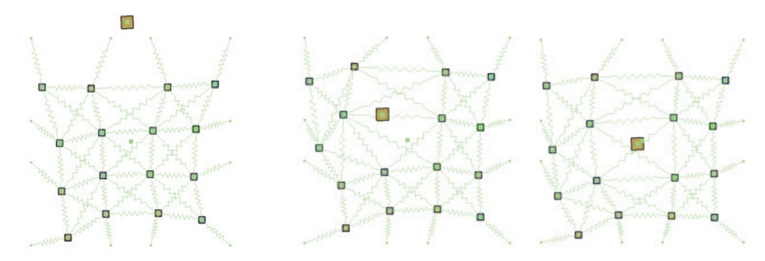
Figure 2: Modelization

Figure 2 shows the physical network of the modelization. The big square is the attack UAS, and the small ones the defend UAS. The images shows different position of the attack UAS and the re-organized response of the defend UAS.