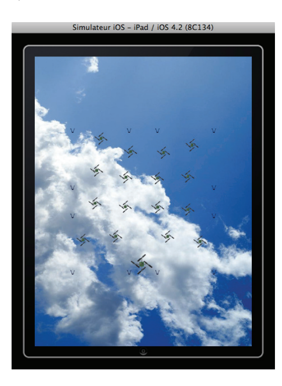
Figure 3 shows screen shots of the demonstrator. This reacts in near real time. The modeling approach shows the desired behavior (deformation of the mesh of the swarm optimized and UAS-UAS avoidance made).