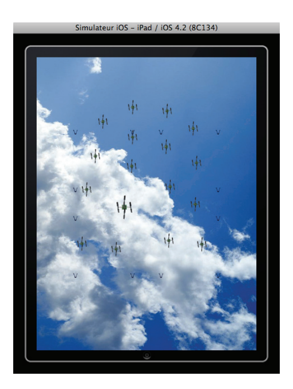
Figure 3: Demonstrator

From this demonstrator, we can draw two initial conclusions: