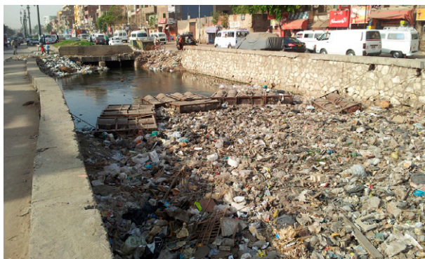
FIG. 3. The water in a channel in Giza, Egypt, is nearly completely covered by garbage and pollution. Under normal conditions, floating barrels hold back the waste, but when the flood comes, the garbage obstructs flow under bridges (in the background) and the water backs up into neighborhoods. Such micro-scale behavior is difficult to monitor, let alone to model or predict.

from human interference, but few have attempted to understand the full complexity of evolving landscapes where such details are critically relevant. Indeed, impacts on forecasting systems have been observed; Hajtasova and Svoboda (1997) attributed the steady decline in operational forecasting skill since the 1970s in the Slovak reach of the Danube River to increased flow alteration by hydropower projects and large-scale land-use change. Conversely, when the operation of significant reservoirs is known to the forecasters, downstream conditions can be highly predictable.