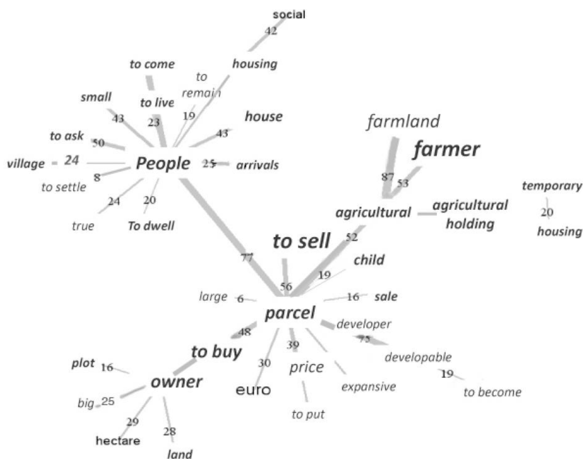
Figure 4: Graph of similarities (translated from French) of the most representative class. For readability, only the strongest relationships are included.

development (land) owners, farmers and others (inhabitants, electors) - only connected through parcel-related terms, in particular dealing with price (to sell, to buy, sale, price, euro), which depends on authorized construction. This even suggests the need to enrich the theoretical framework by considering farmers, or at least “agriculture”, as a full-fledged interest group (distinct from the pro-development group representing landowners’ interests) because these two groups appear independently on the Figure and are only connected through a regulated land market.