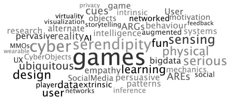
Figure 2. Cloud word related to next generation pervasive games

reason why it doesn't appear in Figure 1. Its aim is to understand how people think, react and adapt as single entities thru the ARG/ARE. That is to say understand, in some specific situations and for many different users, how users: settle their objectives (aims, motivations...), feel (apprehend, sense), analyze (internal mechanisms, mental schemes, culture...), react (skills, know-how), adapt (auto-organize, i.e. use auto-learning curves to feel/analyze/react in case of unknown situation, return over experience); prioritize their own objectives, depending on the situation, change their objectives in case they cannot feel/analyze/react (adaptation to avoid cognitive burn-out). Several tasks have been identified to provide an efficient framework.