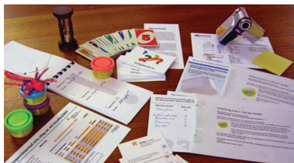
Figure 1. Example of playful probing material distributed to the households.

The interviewer visited the households in both countries at the beginning of the study and provided a questionnaire to focus on devices and equipment that were currently installed in the household and the playful probe package (see Figure 1 as an example) including creativity probing cards, modelling clay, pens and post-it notes. The French households received a specially designed game called ‘1000 miles’ that focused on the central research questions on interaction techniques, applications and overall awareness building, while the game in Austria was a variation of a game called Personality – asking the participants to construct a TV product that best fits their needs (including questions related to the control of this TV product). The modelling clay was added to the probe package to encourage the participants to build some designs of simplified versions of the controls they would want to have.