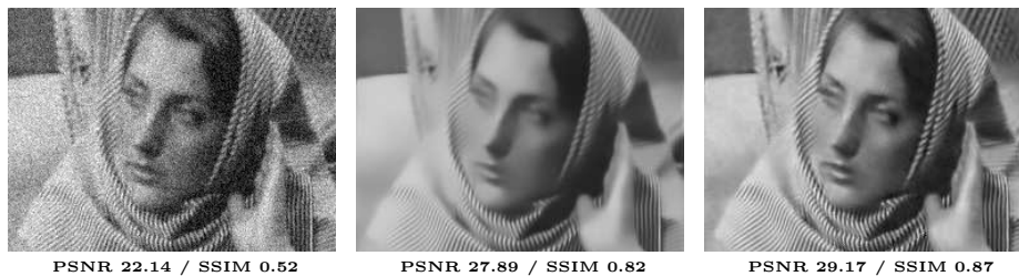
Fig. 3. (left) Noisy image f = u_0 + w , (center) nonlocal-means u^* , (right) debaised \tilde{u}^* .