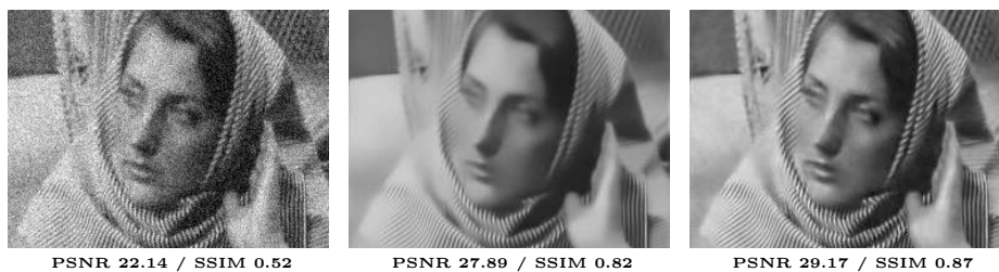
Fig. 3. (left) Noisy image f = u_0 + w , (center) nonlocal-means u^* , (right) debaised \tilde{u}^* .