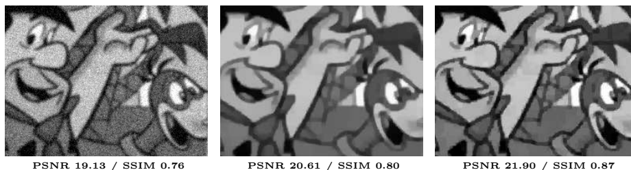
Fig. 2. (left) Blurry image f = \Phi u_0 + w , (center) TV u^* , (right) debaised \tilde{u}^* .