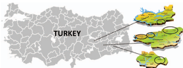
Fig. 1. Collection sites of Vitis vinifera ssp. sylvestris from Eastern Turkey.

Genetic diversity within the collection of 34 grape accessions were assessed by 22 nuclear and three chloroplast SSR markers. We detected a total of 61 alleles at the 22 nSSRs loci analyzed. The number of alleles per SSR locus ranged from 4 (VVIIn16) to 20 (VVIv67) and the mean