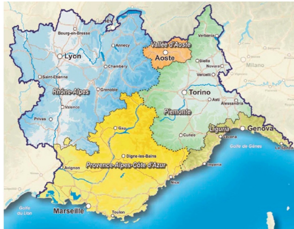
IMAGE 3. Euroregion Alpes-Méditerranée