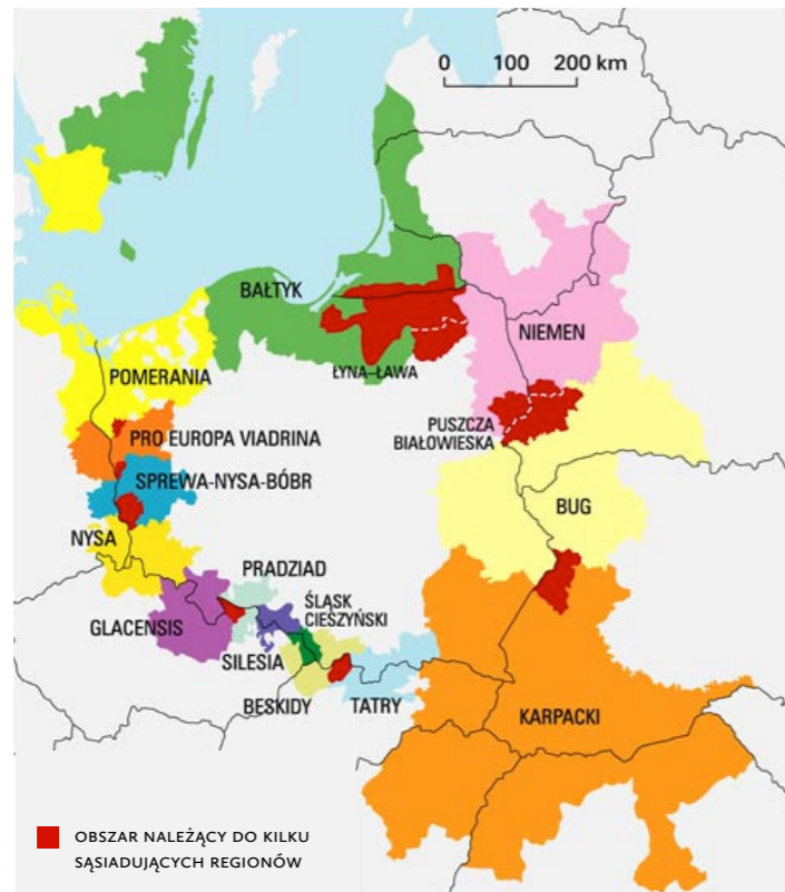
IMAGE 1. Euroregions in Poland