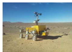
Figure 1 : SAFER rover equipped with the 3 ExoMars instruments in the Atacama Desert, Chile

The SAFER trial test site was located close to the Paranal ESO's Observatory (European Southern Observatories) while the operations were conducted in the Satellite Applications Catapult remote Center in Harwell, UK. The location was chosen for its well-known resemblance with Mars' surface and its arid dryness.