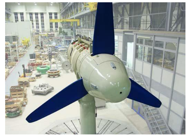
Fig. 5. Voith Hydro turbine.