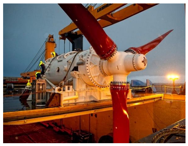
Fig. 2. Andritz Hydro Hammerfest HS1000 turbine © [12].