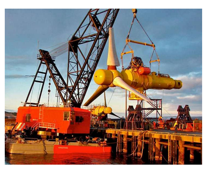
Fig. 7. Alstom tidal turbine.

In 2013, Alstom successfully installed a 1 MW tidal current turbine at EMEC tidal test site after the acquisition of Tidal Generation Limited (TGL) [23-24]. Figure 7 shows the Alstom's 1 MW tidal turbine system. This tidal turbine weighs 150 tonnes and has three pitchable blades, a rotor diameter of 18 m and a nacelle length of 22 m. A standard drive train and power electronics device is inside the nacelle. This turbine system can be installed in a water depth between 35 and 80 meters. It can generate electricity with a tidal current between 1 m/s and 3.4 m/s, and reaches the rated power for a tidal current speed of 2.7 m/s. This 1 MW Alstom tidal turbine is under extensive testing and analysis in different operational conditions off Orkney islands throughout 2013 over an 18 month period.