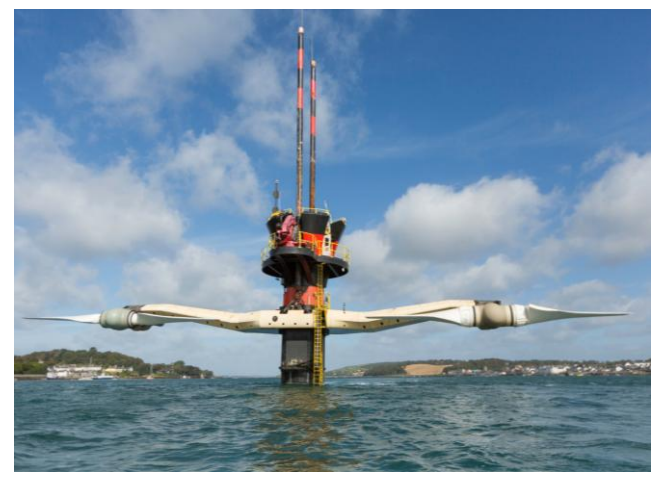
Fig. 4. SeaGen S turbine.