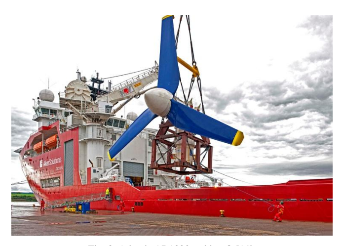
Fig. 3. Atlantis AR1000 turbine © [14].

rotor diameter) which was tested at Bénodet estuary near Brest in 2008. The prototype D10 turbine is now completing the construction and is scheduled to be installed in the Fromveur passage at the end of 2014. Larger turbines D12 and D15 with power capacities of 1~2 MW are under design for future turbine farm applications [19-20].