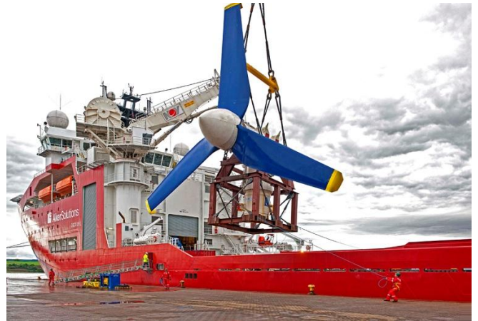
Fig. 3. Atlantis AR1000 turbine.

rotor diameter) which was tested at Bénodet estuary near Brest in 2008. The prototype D10 turbine is now completing the construction and is scheduled to be installed in the Fromveur passage at the end of 2014. Larger turbines D12 and D15 with power capacities of 1~2 MW are under design for future turbine farm applications [19-20].