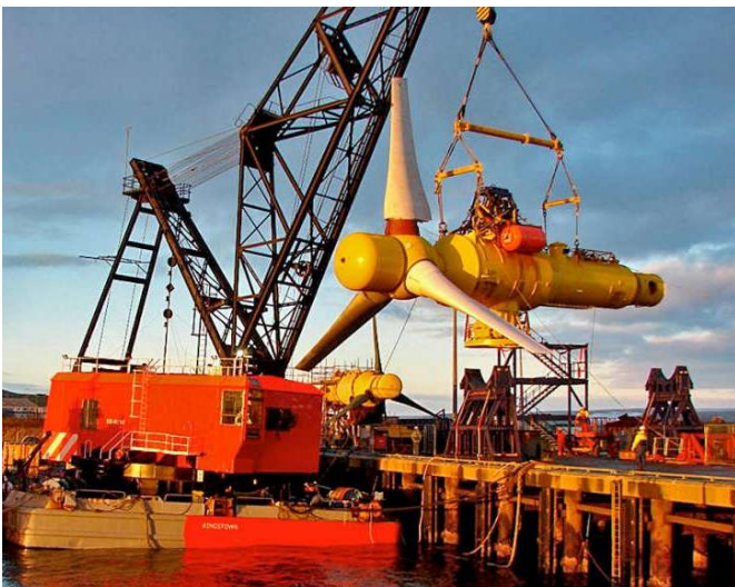
Fig. 7. Alstom tidal turbine © [23].

In 2013, Alstom successfully installed a 1 MW tidal current turbine at EMEC tidal test site after the acquisition of Tidal Generation Limited (TGL) [23-24]. Figure 7 shows the Alstom's 1 MW tidal turbine system. This tidal turbine weighs 150 tonnes and has three pitchable blades, a rotor diameter of 18 m and a nacelle length of 22 m. A standard drive train and power electronics device is inside the nacelle. This turbine system can be installed in a water depth between 35 and 80 meters. It can generate electricity with a tidal current between 1 m/s and 3.4 m/s, and reaches the rated power for a tidal current speed of 2.7 m/s. This 1 MW Alstom tidal turbine is under extensive testing and analysis in different operational conditions off Orkney islands throughout 2013 over an 18 month period.