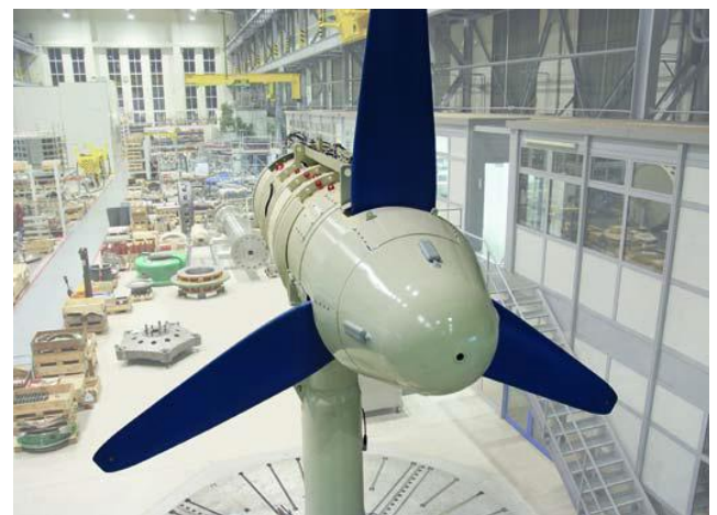
Fig. 5. Voith Hydro turbine © [18].