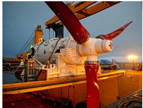
Fig. 2. Andritz Hydro Hammerfest HS1000 turbine.