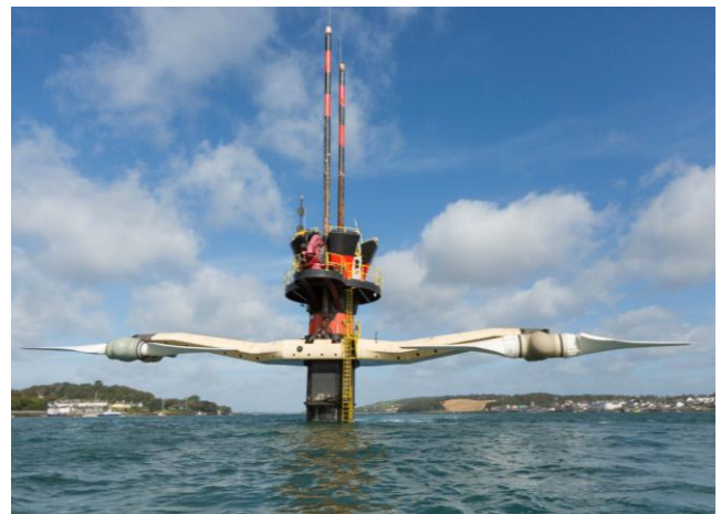
Fig. 4. SeaGen S turbine © [15].