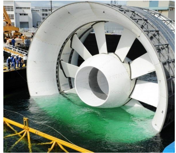
Fig. 1. DCNS-OpenHydro turbine © [11].

future installation in the Pentland Firth in Scotland and the Bay of Fundy in Canada.