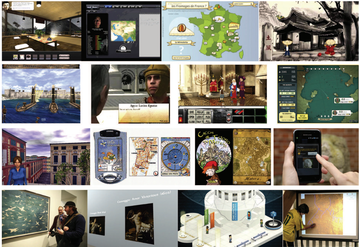
Fig. 1. From top to bottom, each row depicts representative serious games (SGs) for cultural awareness ( Icura , Real Lives 2010 , Les Fromages de France , Yong's China Quest ), historical reconstruction ( The Siege of Syracuse , Roma Nova , Time Mesh , High Tea ), architectural/natural heritage awareness ( Travel in Europe , VE-Game , O' Munaciedd , Tidy City ) and artistic/archaeological heritage awareness ( Tate Trumps , Thiatio , Time Explorer , Dessine-moi un Mammouth ).

perform tasks like shooting or avoiding obstacles, mechanics which are hardly related to cognitive gain, but can be included as sub-tasks or mini-games for the sake of engagement. This is the case of Streets of Culture and Ancient Olympia , including respectively driving and sport sessions. The mini-games in Multi-touch rocks can be considered action games as well. However, in this kind of gameplay the learning content is relatively low, and games tackle primarily engagement rather than actual cognitive gain.