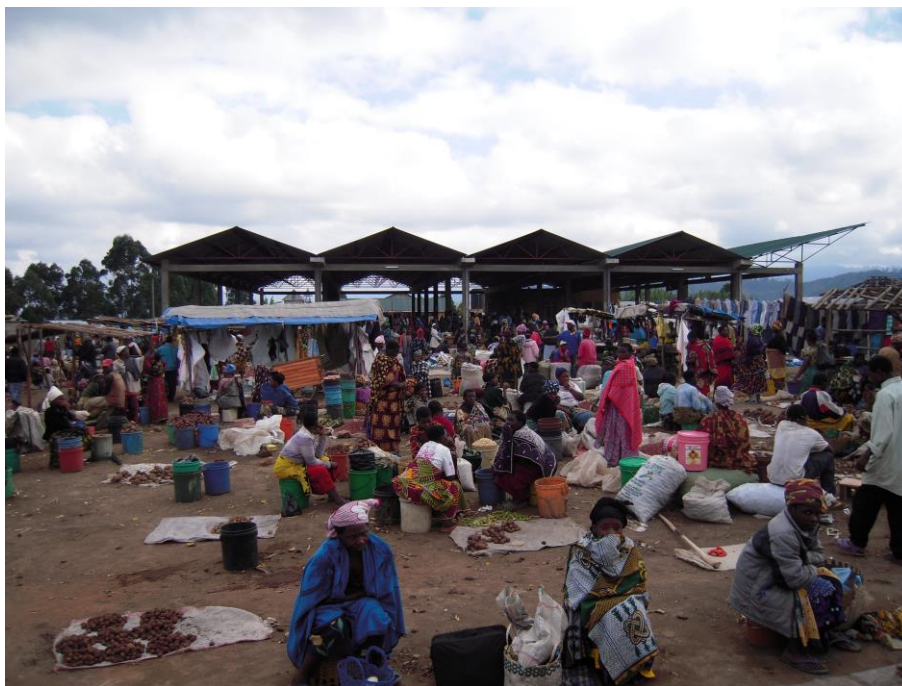
Figure 3, Kiwira market, S Racaud, 2012

The business of fresh foodstuffs occupies the most important part of the open space, which is divided into sections according to the type of produce. These crops are locally grown, and sold by farmers who bring a part of their own crop as well as crops bought in surrounding farms. The vegetables (carrots, tomatoes, green peas), the tubers (cassava, yam, sweet potato), and the fruits (avocado, pineapple) are stocked in wicker baskets of about 30kgs. A small part of the stock is set up on the floor, showing it's best face in small piles that represent the unit of sale. The unit for round potatoes is the basket, that is about 18kgs. The business here is retail sale to local customers. Sellers have spread to in front of the market and along the left fence, showing that the formal infrastructure is already too exiguous. These commercial exchanges correspond to the model of an imperfect market, i.e. non-standardised transactions, the use of piles or buckets instead of weight, volatile prices and deficient access to information and to the market. In a liberal economic environment, commercial transactions, regardless of quantity, give opportunities to power relations to express themselves. Asymmetries appear as differences in bargaining capacities, the latter depending on many factors: supply/demand balances, access to information, to the market, perishability, specific actors strategies, etc.