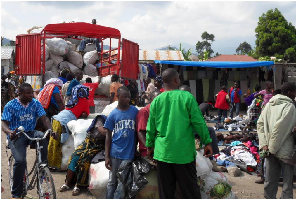
Figure 4, Trucl loading, Kiwira market, S Racaud, 2012

The wholesalers come from distant, big cities and come directly or send an agent to buy and to organise transport of the banana bunches. Often, orders are made to local agents, who must bring the requested amount on market or the day before. The 8 to 15 tonne trucks are loaded in front of the main gates. During the market day, the wholesalers have to ensure that the order is fulfilled. If the local agents did not bring enough bananas, the wholesalers get supplies from the numerous banana sellers. The buyers have to pay a tax that represents about 50USD per tonne. There are between 10 to 20 trucks per market and the total amount of collected taxes can reach 12000USD. The taxes are collected for the district, and 15% are paid back to Kiwira. This income is increasing, as a consequence urban investments are underway, e.g. in 2011 the market's committee financed the building of a guesthouse in front of the market. A petrol station and a new building are under construction; the latter will be a SACCOS office. The boost in agricultural activities means an increase in incomes and in the urbanisation of the town.