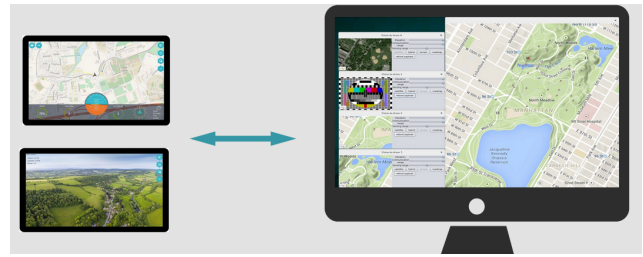
Figure 4. The user interface of the ParCS-S2 project.

An illustration of the project is given in Figure 4.