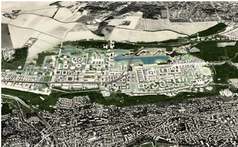
Figure 2. Model of the Saclay territory project, XDGA website.