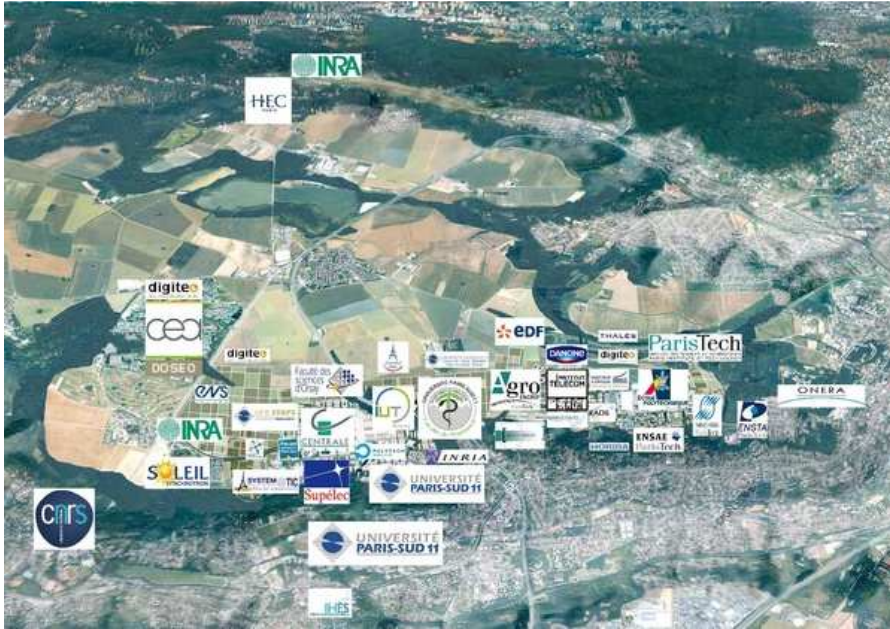
Figure 1. Saclay territory map with institutions logos, 2009, FCS website.

By contrast, the designers use models and drawings (Figure. 2 and 3) in order to project the future spatial organization, though architecture and urbanism.