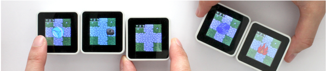
Figure 1. Fat and Furious is a collaborative tangible video game running on Sifteo Cubes.

Conservatoire National des Arts et Métiers - CEDRIC & ENJMIN 292 rue Saint Martin, Paris, France