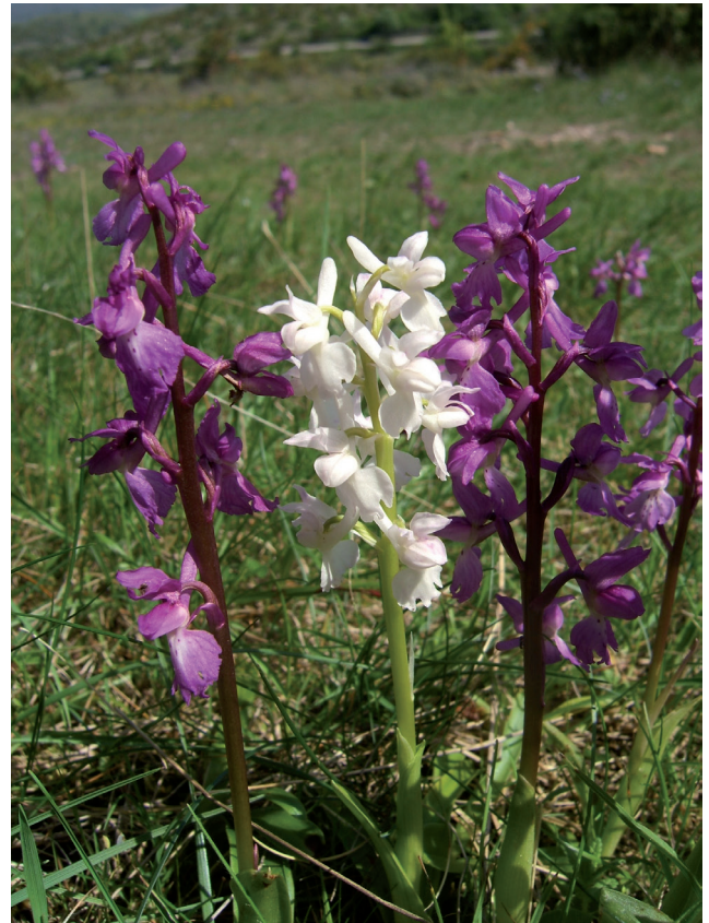
Fig. 1 White- and pink-flowered individuals in natural populations of purple individuals of Orchis mascula .