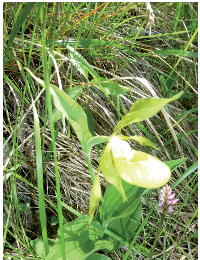
Fig. 2 "Chlorantha" morphs of Ophrys scolopax (left) and Cypripedium calceolus (right).