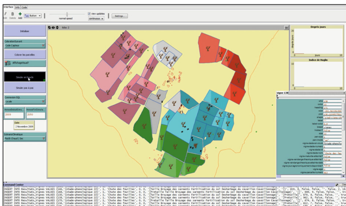
Figure 3. Screen capture of DAHU-Vigne model.

model to determine the potential harvest date (the start of the harvest depends on the decision of the winemaker).