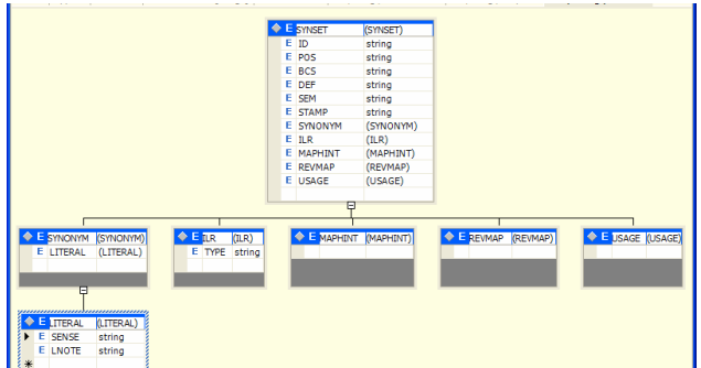
Figure 1 Serbian WN XSD schema in .NET XML designer. The element SEM is specific for SWN.

The C# programming language and Microsoft .Net were chosen as the basic development tools. Visual Studio .NET is a complete set of development tools for building ASP Web applications, XML Web services, desktop applications, and mobile applications. Visual Basic .NET, Visual C++ .NET, Visual C# .NET, and Visual J# .NET all use the same integrated development environment (IDE), which allows them to share tools and facilitates the creation of mixed-language solutions. In addition, these languages leverage the functionality of the .NET Framework, which provides access to key technologies that simplify the development of ASP Web applications and XML Web services.