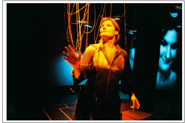
Figure 1. The Alma Sola opera

home. By building a collection of the opera fragments, a new kind of interaction would take place during the viewing of the opera. So it is this kind of environment our first software prototype ReCollection is aiming to be.