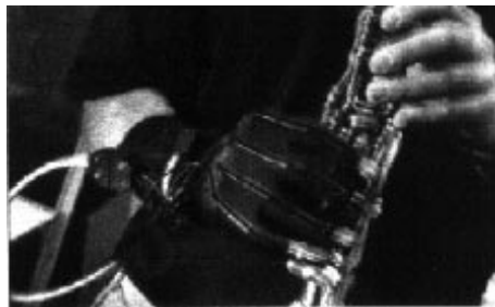
Figure 5: The data-glove used while playing a clarinet.

A study of mapping strategies and the real-time control of additive synthesis using a timbral space built by the analysis of clarinet samples from the Studio-on-Line project [7] has been developed by B. Rován, M. Wanderley, S. Dubnov and P. Depalle[25] and was presented at the Kansei workshop [2] in Genoa, Italy. The main object in this work was to study the influence of the choice of mapping between controller