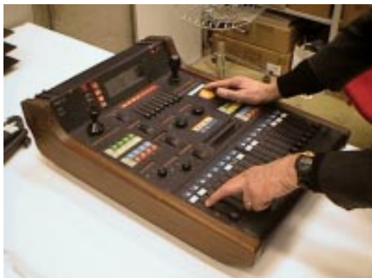
Figure 1: The PACOM console

to control the first generation of digital synthesizers [17]. In the 80's, this question was again considered at Ircam, leading to the development of the PACOM system 4 5 .