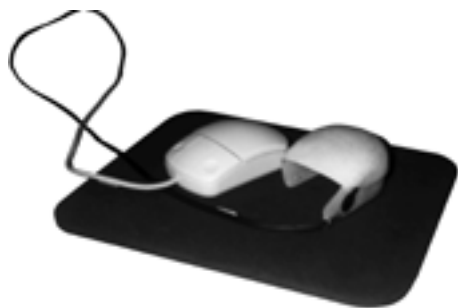
Figure 6: “Jerry” - the 4D Mouse.

A. Terrier, P. Pierrot and X. Rodet collaborated with on the development of JERRY, a four dimensional mouse - a normal computer mouse equipped with two pressure sensors, allowing the continuous control of 4 parameters [22]. Several