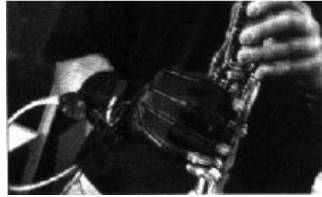
Figure 5: The data-glove used while playing a clarinet.

A study of mapping strategies and the real-time control of additive synthesis using a timbral space built by the analysis of clarinet samples from the Studio-on-Line project [7] has been developed by B. Rovan, M. Wanderley, S. Dubnov and P. Depalle[25] and was presented at the Kansei workshop [2] in Genoa, Italy. The main object in this work was to study the influence of the choice of mapping between controller