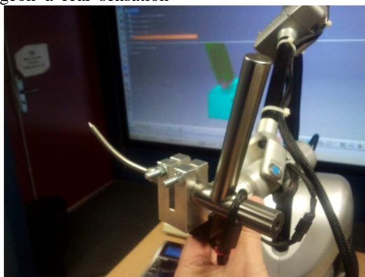
Fig. 3. The instrument tightened by the piece is tied to the haptic arm

The intermediate piece of aluminum has been made at our workshop by Numerical Control of Machine Tools (figure 3). We observe the 90° modification orientation compared to the previous 3D-printing machine handle (figure 2)