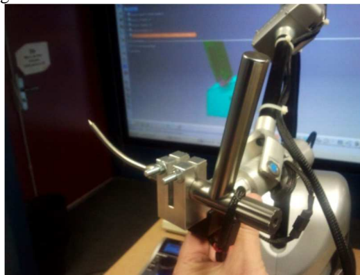
Fig. 3. The instrument tightened by the piece is tied to the haptic arm

The intermediate piece of aluminum has been made at our workshop by Numerical Control of Machine Tools (figure 3). We observe the 90° modification orientation compared to the previous 3D-printing machine handle (figure 2)