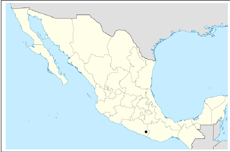
Map 1. Location of Yoloxóchitl Mixtec in Mexico.